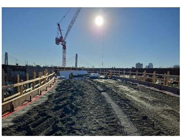
Figure 2: Construction of the new direct E. Columbia Street off-ramp is ongoing.