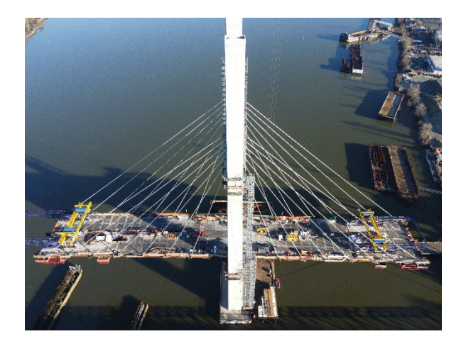
Figure 3: Girder erection, deck panel, and stay cable installation for the main bridge continues. In this photo, 7 pairs of cables are installed on both the south and north side of the tower.