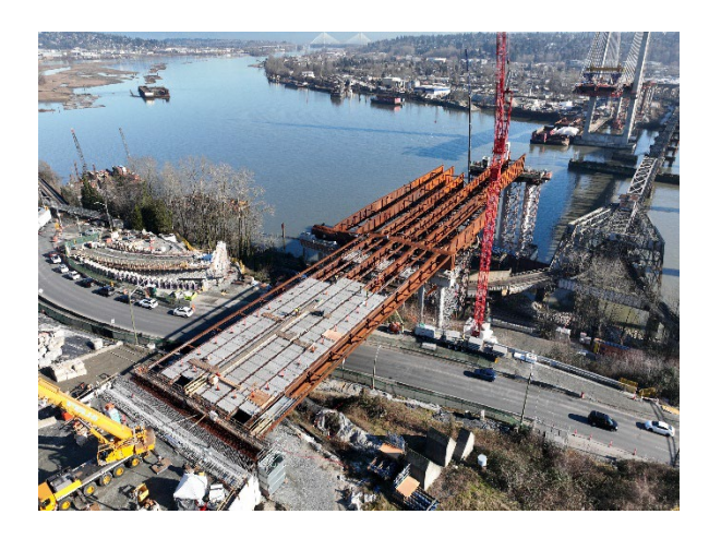
Figure 1: North Approach girder erection continues above Front Street in New Westminster.