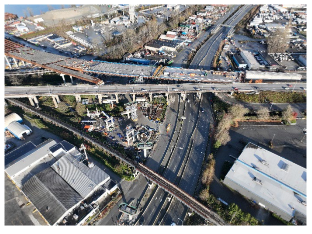
Figure 4: Aerial view of the South Approach shows progress on deck panel installation and recent concrete deck pours to create a smooth surface before asphalt paving.

Figure 3: Girder erection, deck panel, and stay cable installation for the main bridge continues. In this photo, 6 pairs of cables are installed on both the south and north side of the tower.