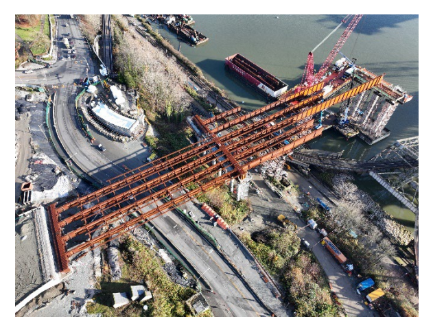
Figure 1: North Approach girder erection continues above Front Street in New Westminster.