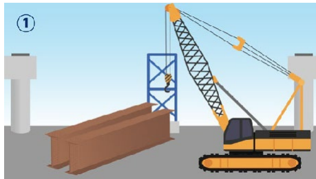
1. A large crane lifts the steel girder.