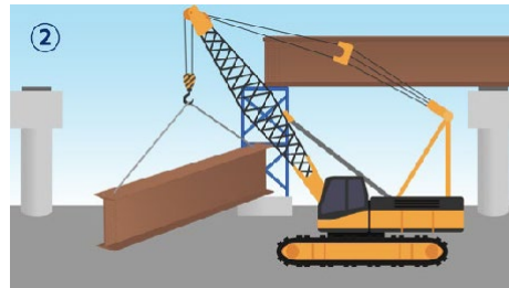
2. The girder is lifted in place to connect the bridge piers. A temporary tower supports the girders as they are safely secured.