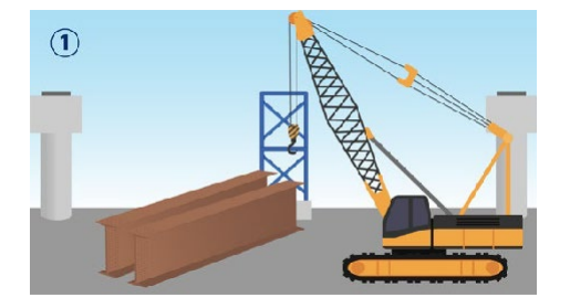
1. A large crane lifts the steel girder.