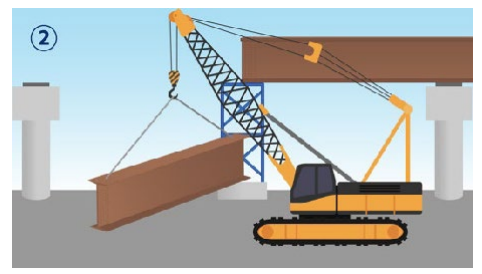
2. The girder is lifted in place to connect the bridge piers. A temporary tower supports the girders as they are safely secured.