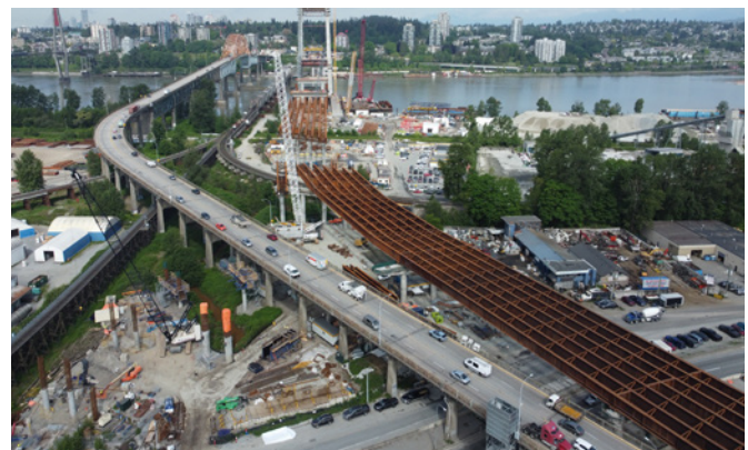
In Surrey, girder installation and bridge deck construction continues for the south approach. Construction continues on the Highway 17 / Old Yale Road overpass.