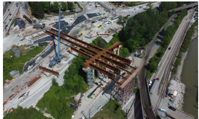
In New Westminster, girder installation is underway. Roadwork and utility work continue along Royal Avenue, McBride Boulevard and Columbia Street, and multi-use path construction continues along McBride Boulevard.