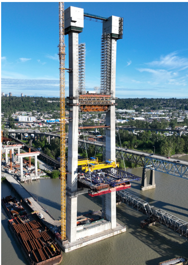
The 167-metre tall bridge tower is complete! This is now the tallest bridge tower in B.C. Bridge deck construction continues, with crews installing steel girders, concrete deck panels and stay cables outward from the bridge tower.

This update provides an overview of ongoing and upcoming work. More detailed construction notifications can be viewed on the Construction page at pattullobridgereplacement.ca .