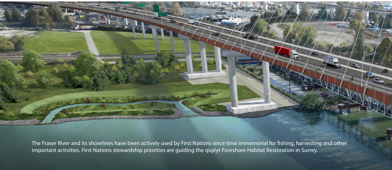
The Fraser River and its shorelines have been actively used by First Nations since time immemorial for fishing, harvesting and other important activities. First Nations stewardship priorities are guiding the qiqéyt Foreshore Habitat Restoration in Surrey.

Construction of the bridge deck is underway. Construction continues on the new Highway 17 / Old Yale Road Overpass. Eastbound traffic will begin using the new overpass in July 2024. Other current and upcoming construction activities are noted in the graphic above.