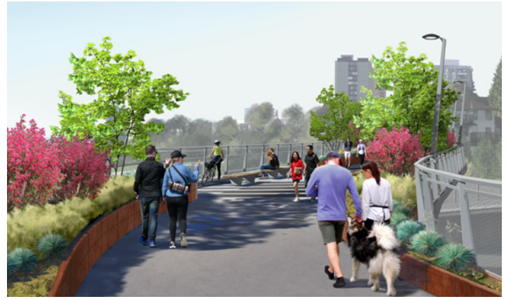
Artist's rendering of the Agnes-Royal pedestrian overpass, a new walking and cycling path over the bridge approach connecting Victoria Hill and downtown New Westminster. Final design features, including plantings, are still being developed.

Bridge deck construction is underway between Pier N1 in the river, and Pier N3 north of Columbia Street. A number of utilities have been relocated, and roadworks and multi-use path construction is underway. Other current and upcoming construction activities are noted in the graphic below.