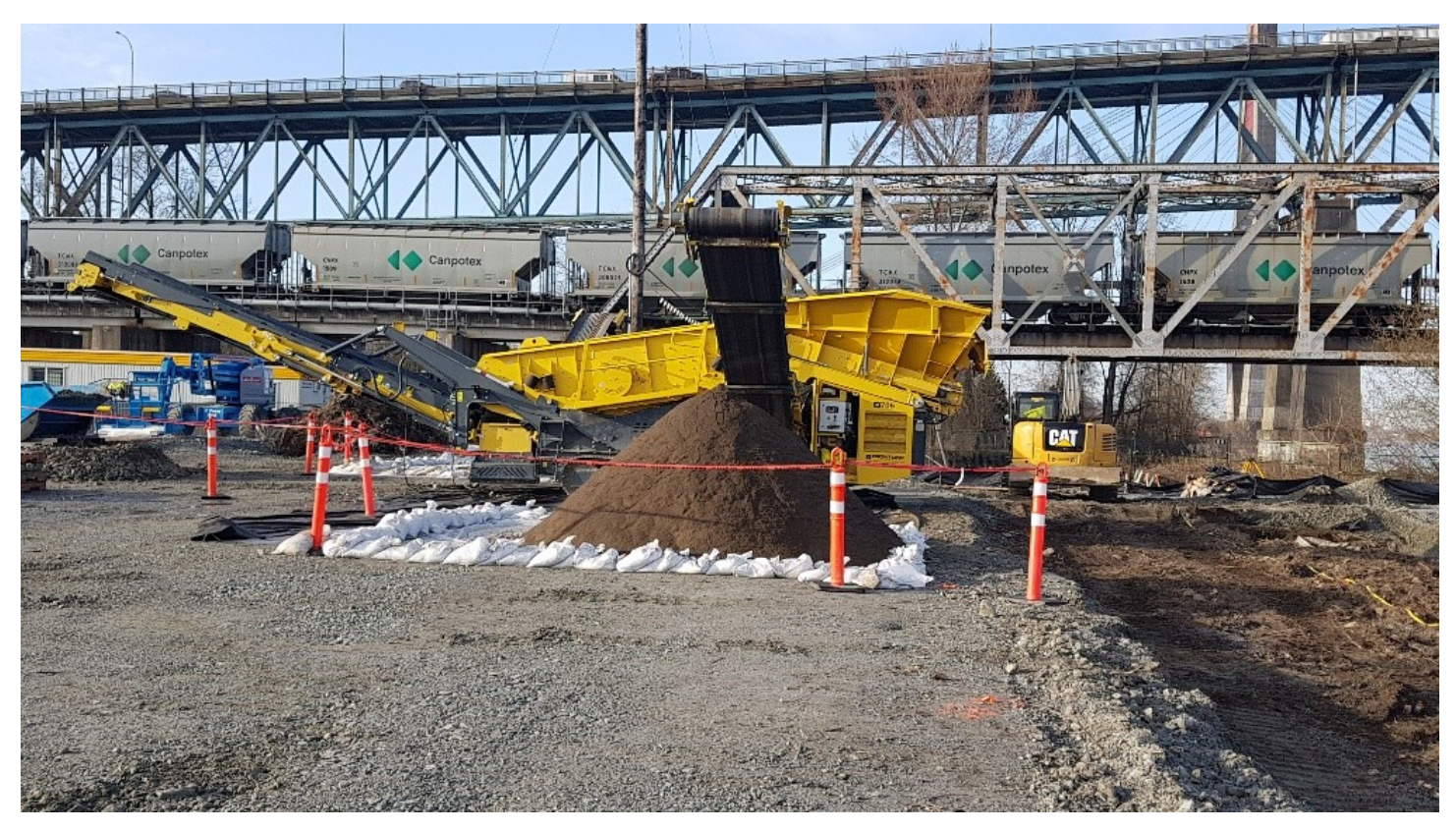
FIGURE 2 – MECHANICAL SCREENER AT S2