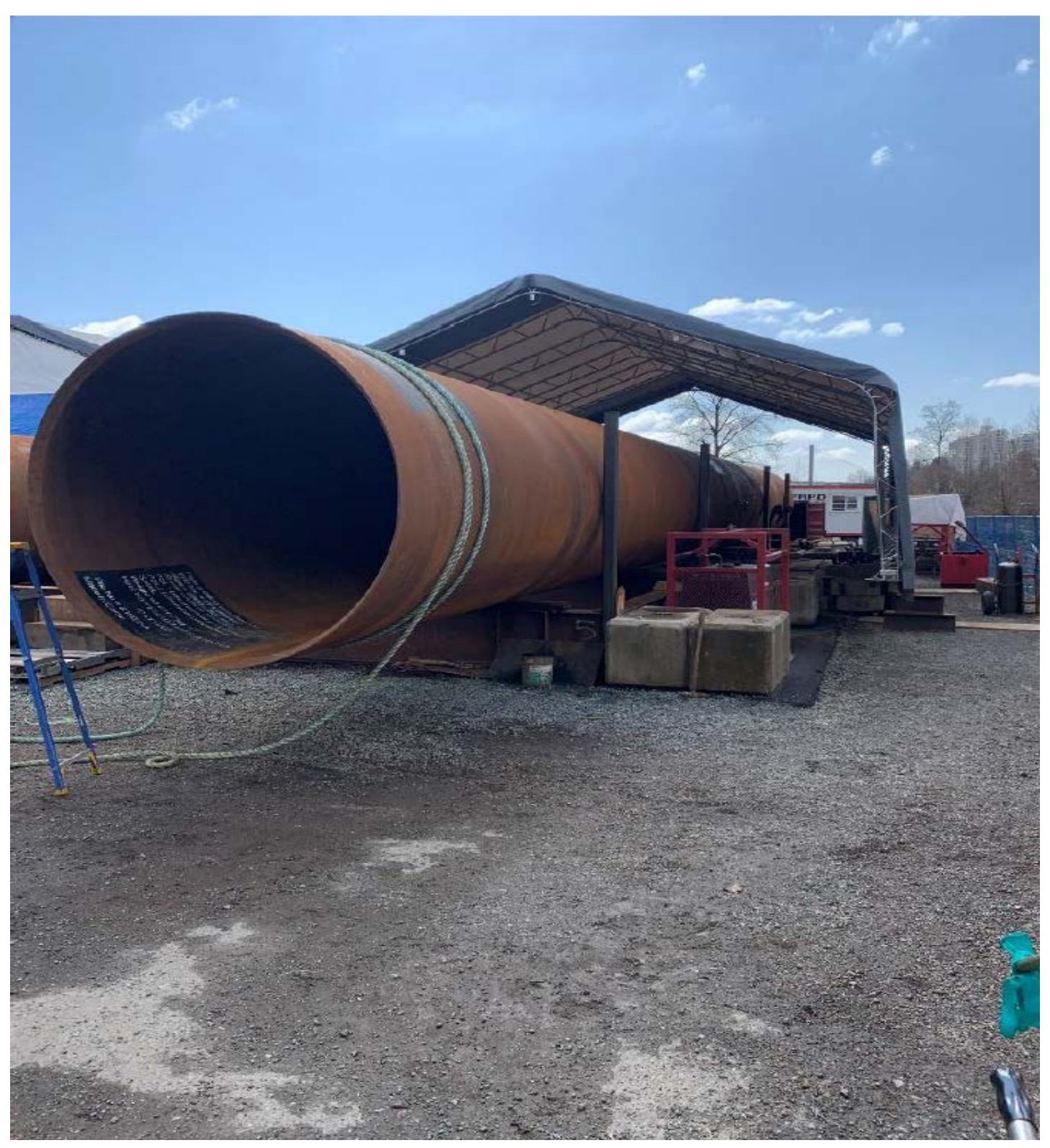
FIGURE 1 – PILE SPLICING OF STARTER SECTIONS