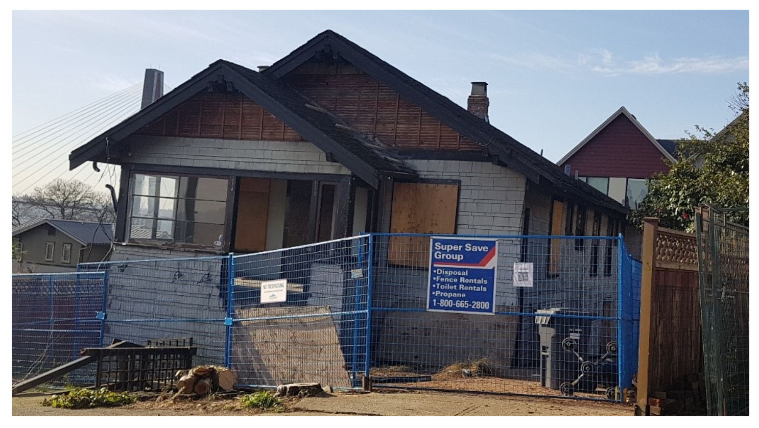
FIGURE 3 – HOUSE DEMOLITION IN NEW WESTMINSTER